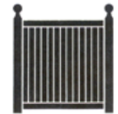
VP164 92 x 92 x 93