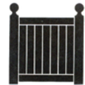
BB165 100 x 100 x 104