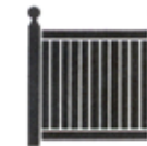
VP164 76 x 76 x 79