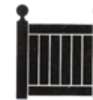
BB164 82 x 82 x 85